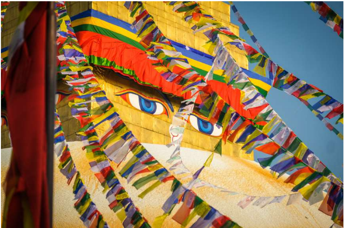
Temple de Swayambunath, Kathmandu